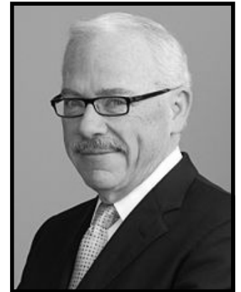
Bob Barr Libertarian Party

They may have their differences, but all are far superior to the Republican/Democrat duopoly. All have agreed to come together on four important issues facing regular Americans today: