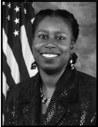
Cynthia McKinny Green Party

VOTE FOR A 3RD PARTY PRINCIPLED CANDIDATE