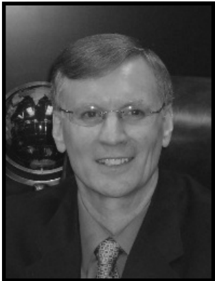
Chuck Baldwin Constitution Party