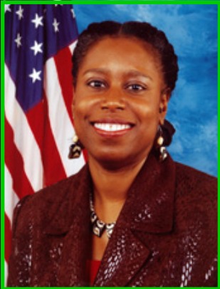
Cynthia McKinney Green Party

VOTE FOR A 3RD PARTY PRINCIPLED CANDIDATE