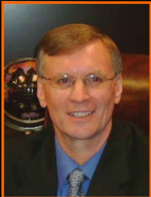
Chuck Baldwin Constitution Party