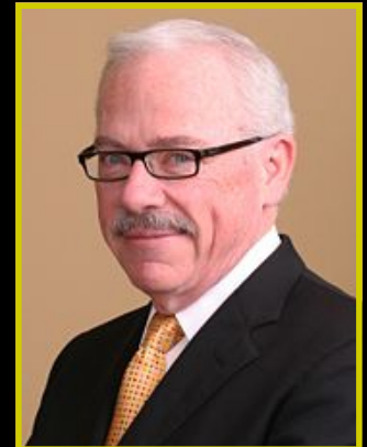
Bob Barr Libertarian Party

They may have their differences, but all are far superior to the Republican/Democrat duopoly. All have agreed to come together on four important issues facing regular Americans today: